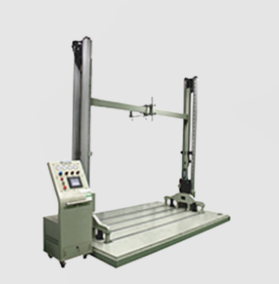
Pneumatic Zero Drop Tester