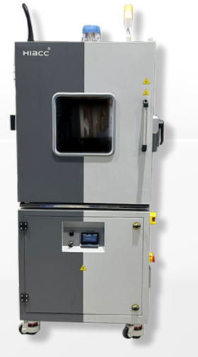
Temperature Test Chamber