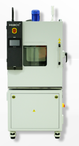
Climatic Test Chamber

Expand your testing horizons with our diverse range of complementary equipment, ensuring comprehensive, accurate, and reliable testing outcomes. your ultimate destination for environmental testing solutions, we provide cutting-edge products to elevate your testing capabilities to new heights.