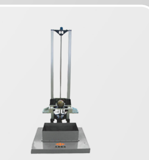
Servo Vertical Shock Tester